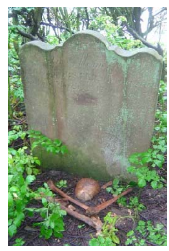
Gravestone very close to edge of the cliff in Dunwich's last remaining cemetery, which will soon be lost to the sea by coastal erosion.

Our test area was an archaeological site off the Suffolk coast showing the remains of Dunwich town. In the 12<sup>th</sup> century Dunwich was a thriving port (the 5<sup>th</sup> largest port in Britain). Coastal erosion however took its toll over the hundreds of years, possibly due to coastal works begun in the 13<sup>th</sup> century, so that today Dunwich is a fraction of its former size with only a few houses remaining onshore. Most houses from the period would have been wooden and thus would not survive to this day, but many of the 17 churches were of brick or stone construction and it is these remains which are visible on the seafloor. Mapping allows reconstruction of the history of the port and can provide rates of coastal erosion. Methodology and trials from the survey will be shown together with plans for future work and new systems – possibly up to 3MHz.